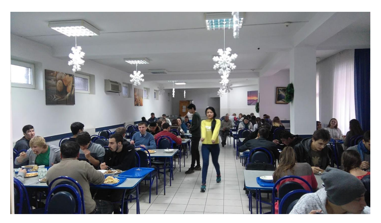
This is a dining room of the University. Students and teachers are eating together here. The food here is tasty and nutritious. And what is important - is not expensive!