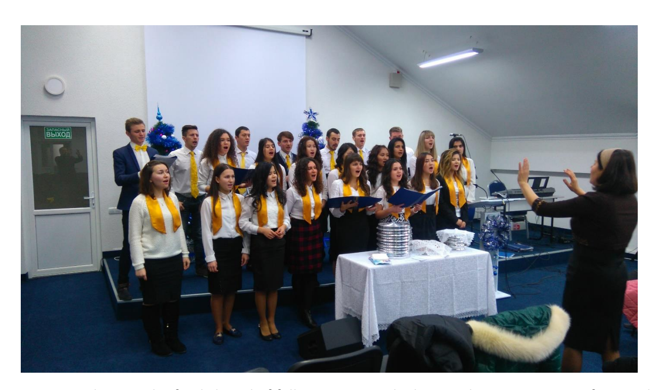
On December 23, the final chapel of fall semester took place at the University conference hall. During the semester, there is a chapel once a week. The student choir participated at this special service. At the end of the service, the Communion has been served.