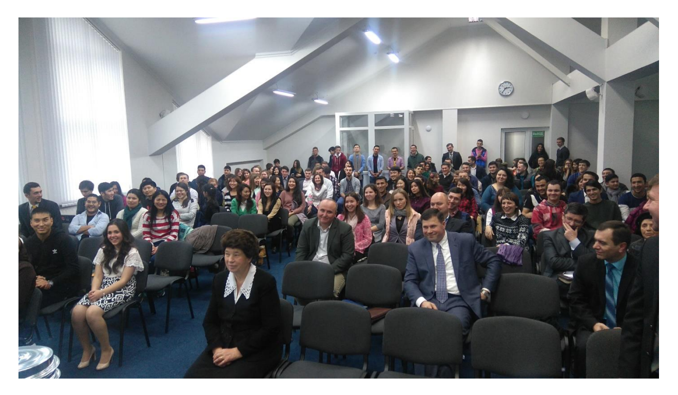
Both students and teachers were part of the audience.